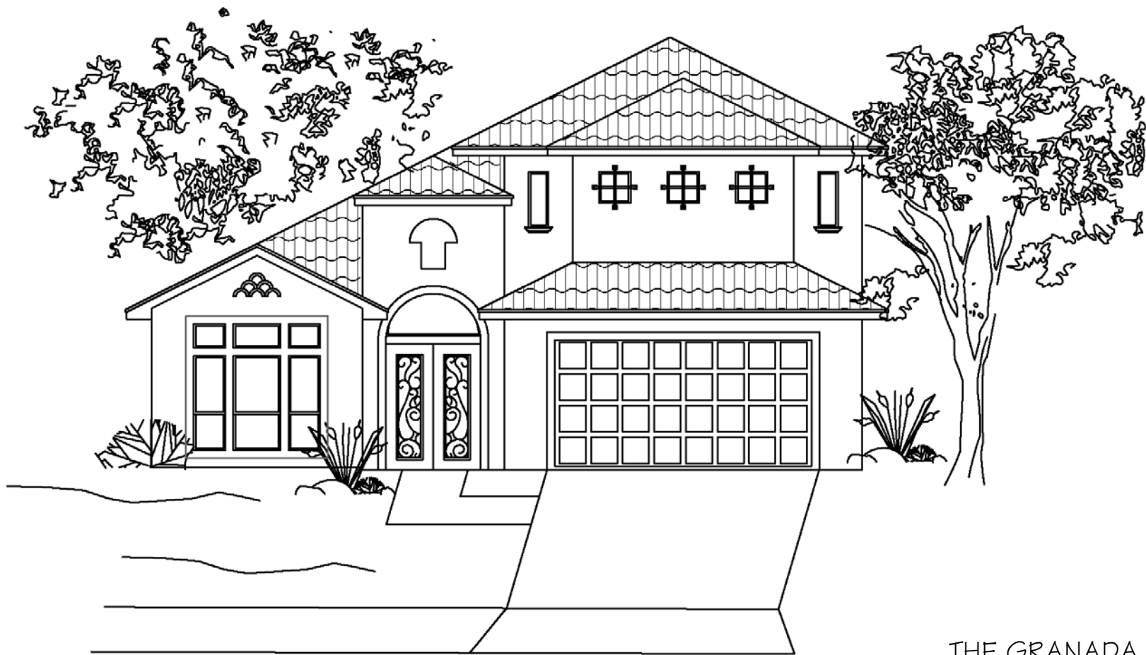
THE GRANADA "B" Mediterranean/Stucco/Tile 10/08