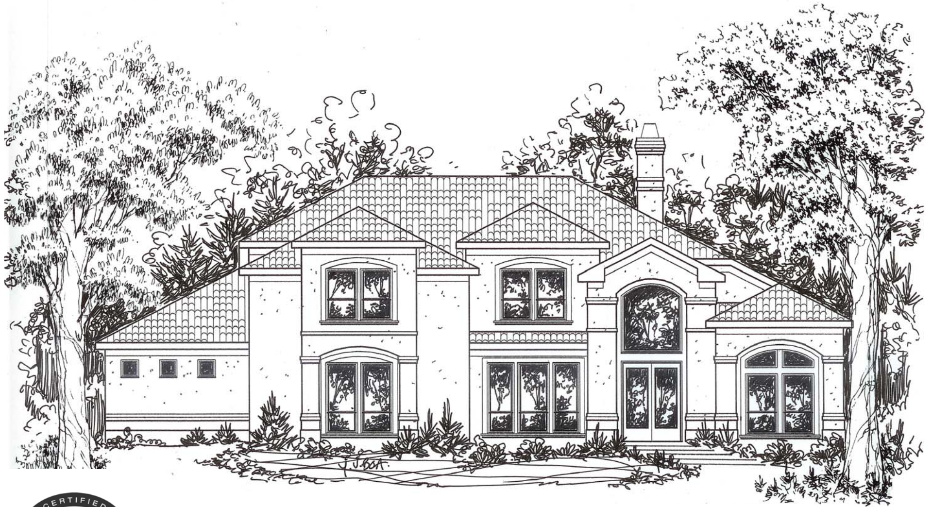
“THE SHENANDOAH” Mediterranean/Stucco /Tile Front Gameroom